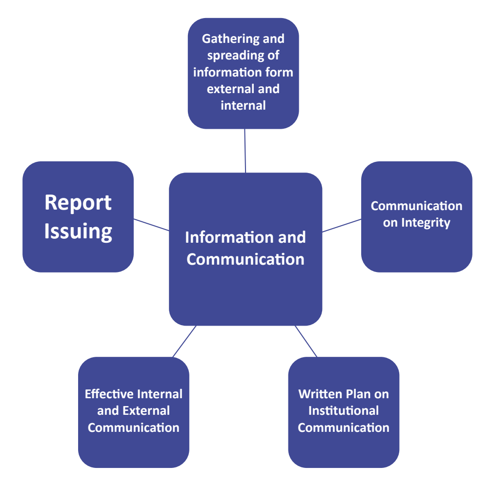
Fig. 3: Internal and External Communication Flows, SAI of Mexico