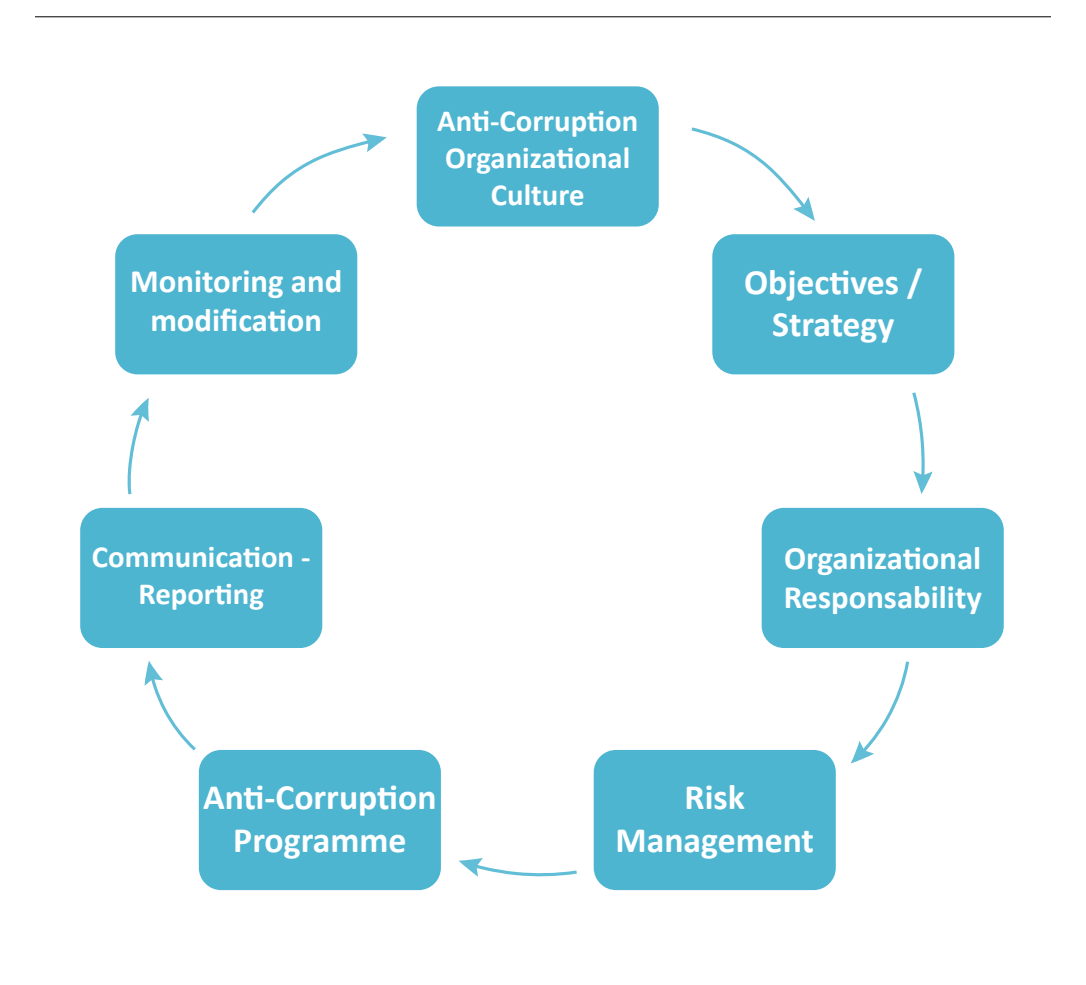
Fig. 1: Components of Corruption Prevention Systems, SAI of Austria